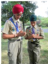
American Sikh Council www.americansikhcouncil.org

The above four SRA workbooks are from grades 1-3; 4-5; 6-8 and 9-12 . All the workbooks can be done by Girl Scouts, Boy Scouts, non-Scouts and by any youth of any Faith. Currently there are several dozen across the country in the program with many non-Sikhs doing it and learning about the Sikh heritage. This is an additional resource for educators and others to teach over 5 million Scouts and 2 million Scout leaders, about the Sikh heritage, identity and the 'turban'/'dastar'.