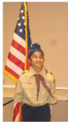
American Sikh Council www.americansikhcouncil.org