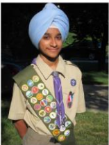
American Sikh Council www.americansikhcouncil.org