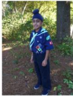
American Sikh Council www.americansikhcouncil.org